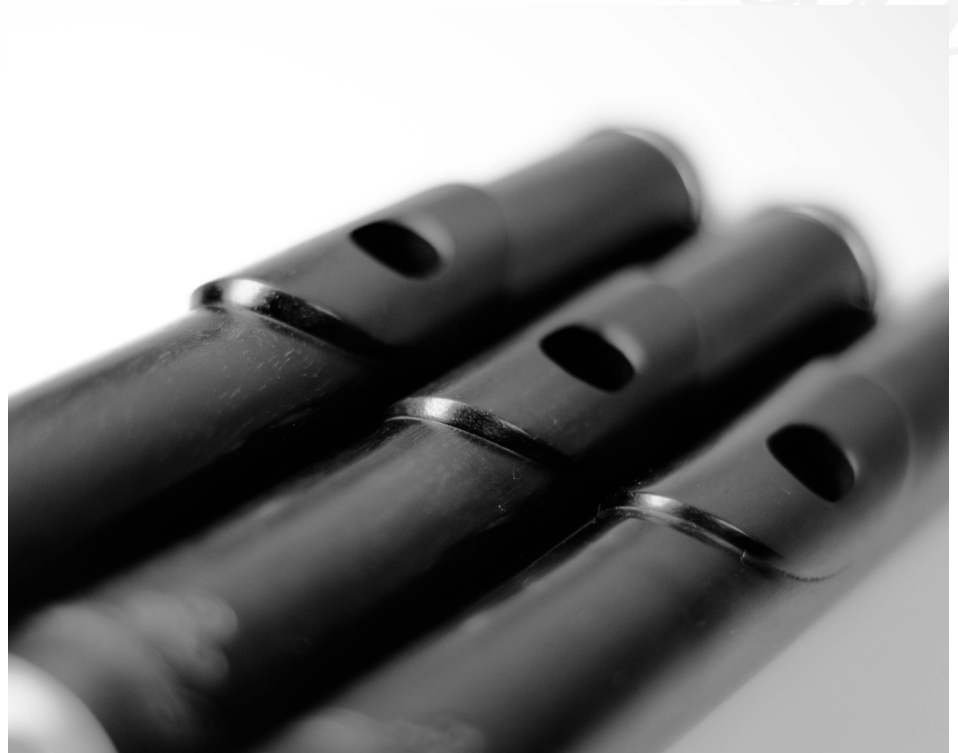
High, medium and low lip plate models.

With the high lip plate you get rich tone colours with strong fundamental in the low register; with the low lip plate, the easiness is reached in the middle and high registers. The medium lip plate: it is precisely the balance between the two.