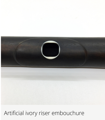
Artificial ivory riser embouchure